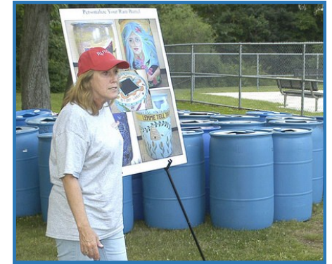
Presentation and Instruction during the workshop